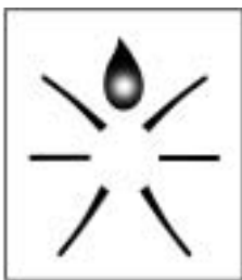
Human Rights Institute of Lyon (IDHL)